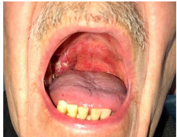
Figure 4 A large exophytic lesion could be seen in the right oropharynx proven to be SCC on biopsy under local anaesthetic.

A 68 year old Caucasian male presented with an exophytic lesion in his oropharynx that was centred on the right soft palate and adjacent lateral pharyngeal wall (Figure 4).