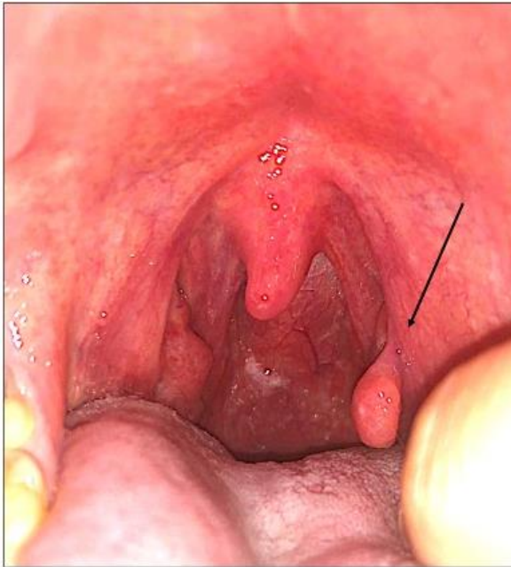
Figure 1 Oropharynx clearly showing a pedunculated polyp arising from the left tonsil (black arrow).

A 26 year old Caucasian male was noticed to have a pedunculated lesion arising from the left tonsil (Figure 1). He was seen in clinic and under local anaesthetic the lesion was excised with scissors. He made an uneventful recovery and the final histology revealed it to be a benign papilloma (Figure 2)