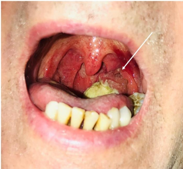
Figure 5 Exophytic tumour involving the left oropharynx. A punched out area (white arrow) could be seen where a 6mm biopsy punch was used to take the biopsy under local anaesthetic in the clinic.

We have found that once anaesthetised, the tonsil can be held with the Blakesley forceps and retracted medially and superiorly without significant distress to the patient. In our experience, the bleeding is controllable with 6% hydrogen peroxide gargles (5mls diluted in 20mls water) and suction. We have not had to utilise bipolar forceps for haemostasis for these biopsies, however, this is available in our clinic area for use if needed.