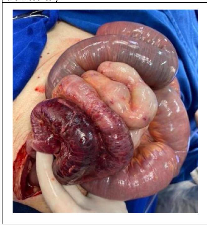
Figure 3. Cavity inventory – the presence of multiple adhesions forming a block near the terminal ileum loop with signs of ischemia, as well as a thickened area in the mesentery.

It was decided to perform a partial colectomy on the right with resection of the ischemic segment, undoing the adhesions found and making a Mikulicz ileostomy, which the patient remains in use until now at his own choice and that of the surgical team, due to its adaptation.