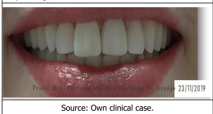
Figure 4. Final appearance of the smile after 3 months of polishing.

the tooth surface, such as coffee and tobacco, plaque accumulation, and the use of some types of medication, being considered superficial stains and easy to remove. On the other hand, intrinsic alterations can be congenital, related to the formation of teeth, or acquired through dental trauma, pulp necrosis, or fluorosis, in which case the pigments are incorporated into the dental structure and are removed with bleaching or more invasive procedures such as wear and/or restoration of teeth [10,11].